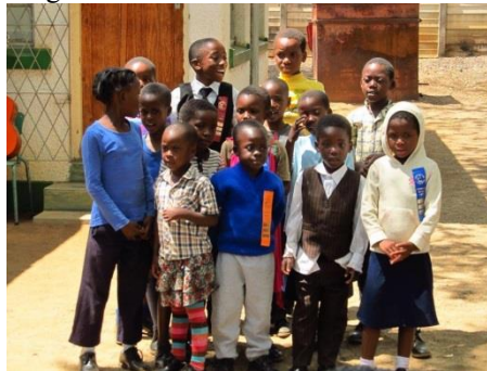
The 14 youngest children from CoG doing their end of year school play

The Children of Grace house is on a 5 acre property, and also has other buildings on the property, including one with many rooms, etc, from where the school children were learning. We will have full use of this property, and are looking at doing farming and poultry also on the property. Exciting hey, and it's great to be able to assist these lovely young children.